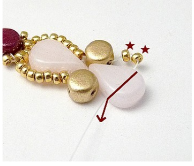
10) Pick up 2 R15, pass through 2nd hole of Amos