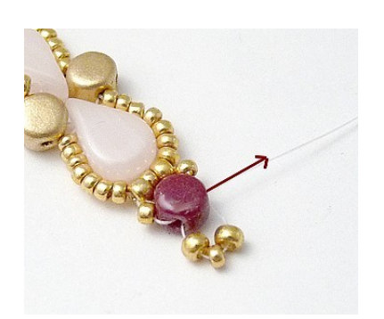
16) Pick up 1 R11, 1 R15, 1 R11, exit through Kalos