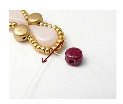
14) Pick up 1 Kalos (C1), exit through 3 following seed beads