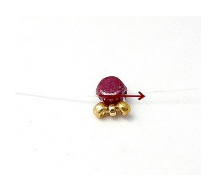
1) Pick up 1 Kalos (C1), 1 R11, 1R15, 1 R11, pass through Kalos again