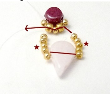
5) Pick up 5 R15, 1 Amos, 5 R15, pass through 3 seed beads again