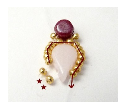
8) Pick up 2 R15 and through all seed beads like picture