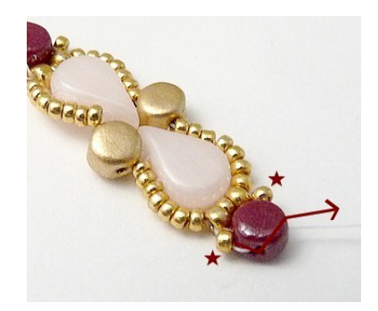
15) Pick up 1 R15, pass through Kalos, pick up 1 R15, exit through R11, R15, R11, 2nd hole of Kalos