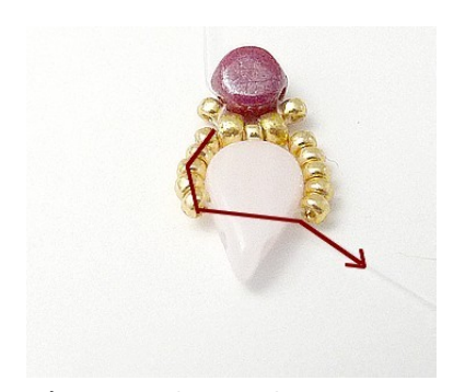
6) Pass through 5 R15 and Amos top hole