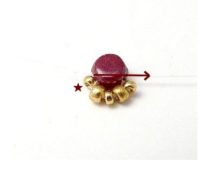
3) Pick up 1 R15 and pass through Kalos again