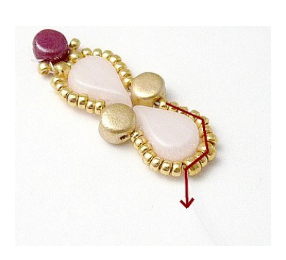
13) Exit through R11