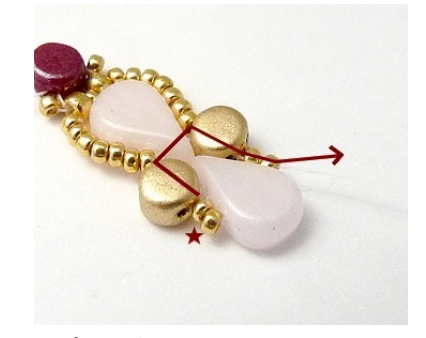
11) Pick up 2 R15, pass through Kalos, Amos, Kalos, 2 R15