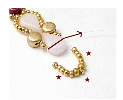
12) Pick up 5 R15, 1 R11, 1 R15, 1 R11, 5 R15, pass through Amos