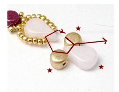
9) Pick up 1 Kalos (C2), 1 Amos, 1 Kalos (C2), pass through Amos and Kalos