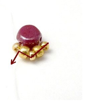
4) Exit through R11