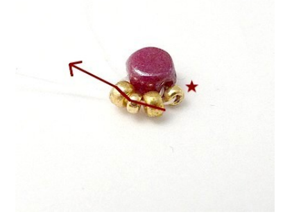
2) Pick up 1 R15 and pass through 3 seed beads again