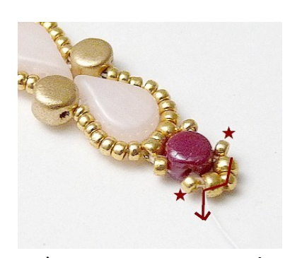
17) Repeat steps 2 and 3 and exit through R11, R15, R11. Repeat steps 5 to 15