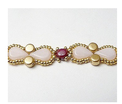
18) Bead a total of 9 elements