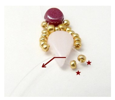
7) Pick up 2 R15, pass through bottom hole of Amos