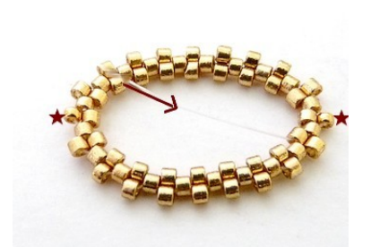
4) Pick up 9 DB, 1 R15 and exit like picture, inside the circle