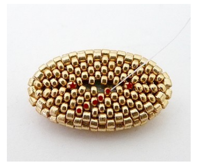
13) Bead a 5th R15 row with this time 1 R15 for each top