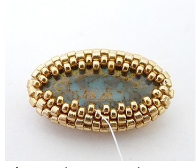
8) Bead a second R15 row, but don't bead corners