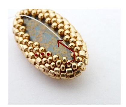
10) Bead a 3rd R15 row, but pass through the existing 2 R15 (don't add new R15)