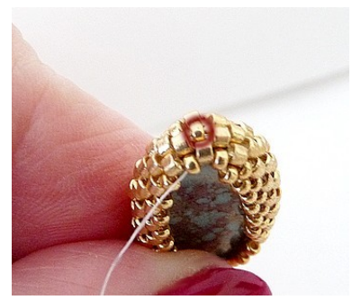
9) Be careful! Place the R15 of step 3 on the top of Athos