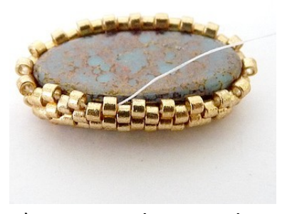
6) Turn work over, place your Athos and bead 2 DB11 rows