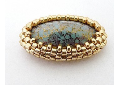
15) You'll now have this