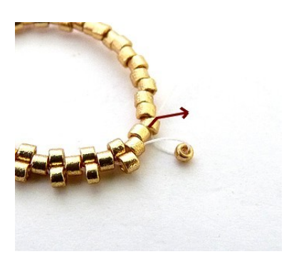
3) Pick up 1 R15