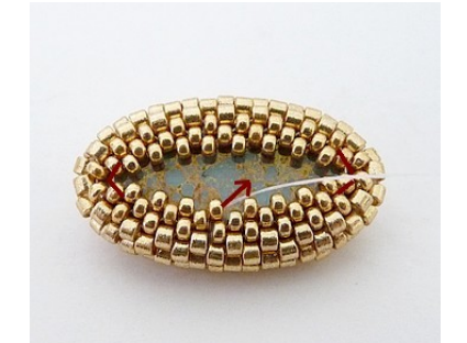
11) Repeat step 10 on the other side