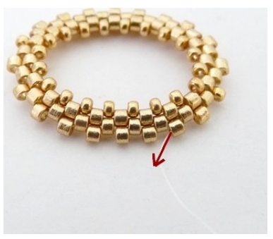
5) Bead 1 R15 row and exit like picture, out of the circle