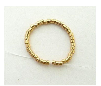
1) Pick up 40 DB and close