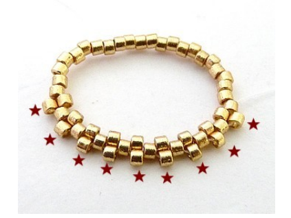
2) Bead 9 DB in Peyote