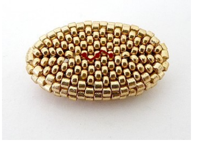
14) Pick up 3 R15 and zip the 2 sides to end