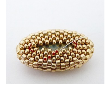
12) Bead a 4th R15 row with the same explanations of step 10