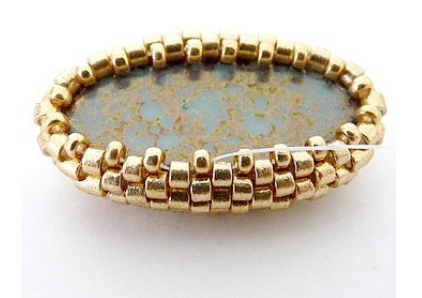
7) Bead 1 R15 row