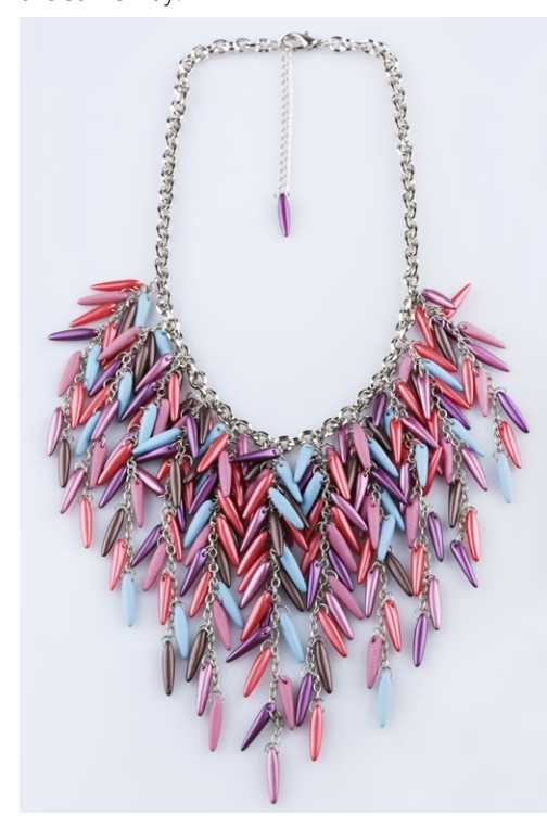
You can also create earrings from as many pendants as you want.

Attach the adjusting chain with a hung Th at one end of the bigger chain using an oval and attach the carabiner to the other end in the same way.