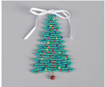
You can make Christmas trees in various color shades and different sizes or use them to brighten up your holiday outfit.