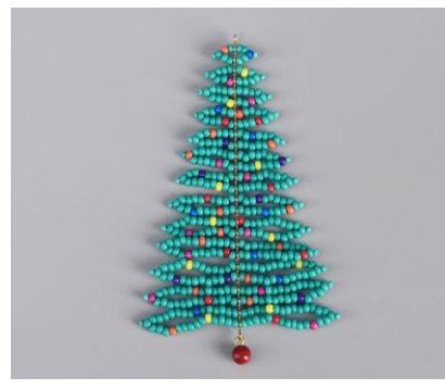
Step 7: Tie the cord, a ribbon or an earring hook to the top hole on the guide.