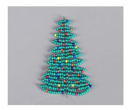
Step 5: If the longest projections are soft, you can thread the line through them one more time. The length of the line should enable this. The line will change sides (from the left to the right and vice versa). At the end, tie off the line with three knots. Pull the end into the R8 and cut it off.