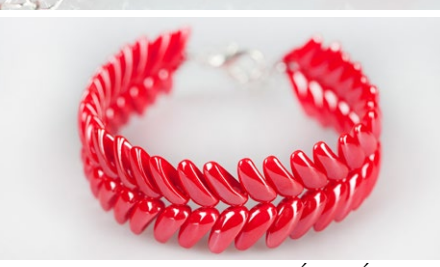
DESIGN BY HELENA CHMELÍKOVÁ