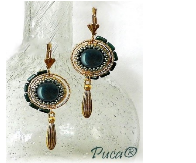
21) Congratulations !

Happy beading! Thank you for respecting my work ©