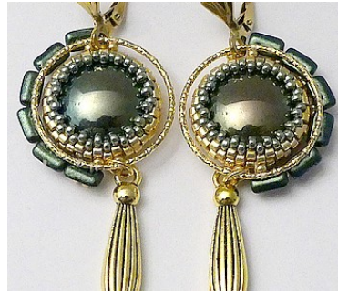
20) You can bead your second earring