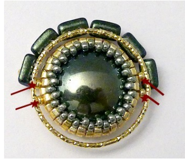
17) Repeat on the other side steps 12 to 16