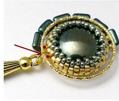
18) Place a ring and a teardrop between the 2 R15