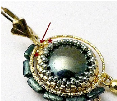
19) Place your earring finding on the other side