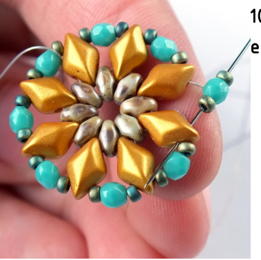
10) ... until you reach the ⁄end of the row.