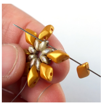
5) ... until you reach the end of the row.