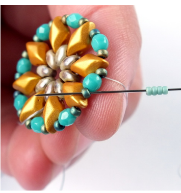
12) Add four 15/0s, skip the next FP bead and pass through the next 11/0 in the row.