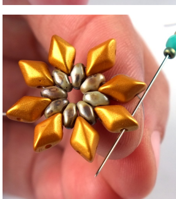
8) Add one 11/0, one FP bead and one 11/0, then pass through the upper hole of the next GD bead.