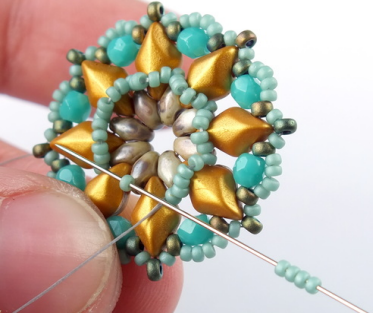
21) Repeat step 20 ...