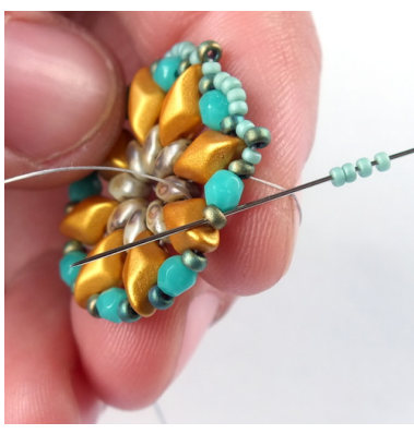
14) Repeat steps 12 and 13 ...

Weave through beads get to the lower hole one of the GD beads.