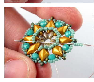
22) ... until you reach the end of the row.