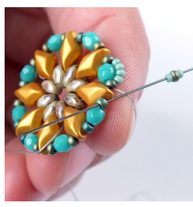
13) Add one 15/0, one 11/0 and one 15/0 and then pass through the next 11/0 in the row.

You will need two 8-9mm cabochons or 8mm (SS39) rivolis and just a little bit more 11/0 and 15/0 seed beads.