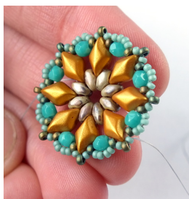
15) ... until you reach the end of the row.