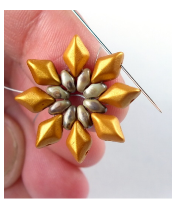
m and then pass back through the upper hole of the same bead.

2) Slide all the beads to the end of the thread and tie a square knot to form a circle. Then pass through the upper hole of the nearest Miniduo.