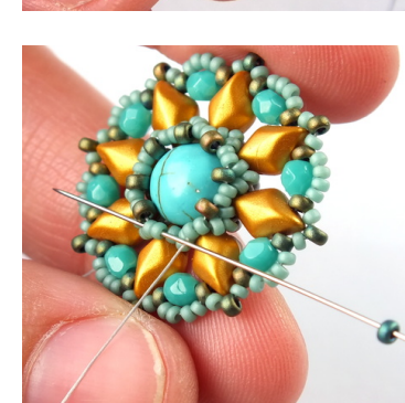
26) ... until you reach the end of the row. Before you finish the row, put the cabochon inside. Keep your tension very tight.