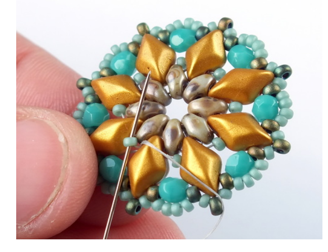
20) Add four 15/0s and pass through the next new 15/0 in the row.

19) At the end of the row make the step-up by passing23) Make the step-up by passing through the firstthrough the first 15/0 you added in this row.three 15/0s you added in this row.