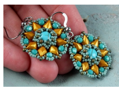
30) Tie a few half-hitch knots and cut off all the remaining thread. Use jump rings to attach earring components of your choice.