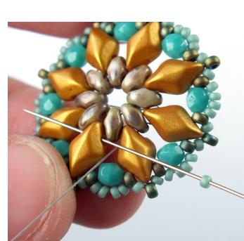
17) Add one 15/0s and pass through the lower hole of the next GD bead in the row.