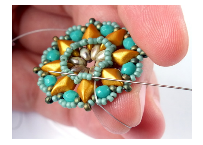
24) Add one 11/0 and pass through the middle two 15/0s from the next group of four.