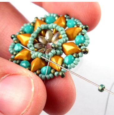
25) Repeat step 24 ...