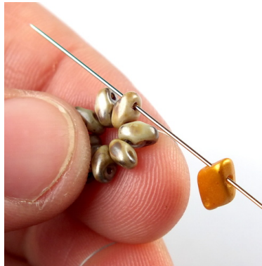
Add one Gemduo and pass through the upper hole of the next Miniduo in the row.