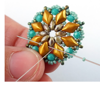
Repeat step 17, until you reach the end of the row.