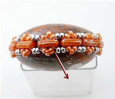
10) You will now have this. Go out like picture