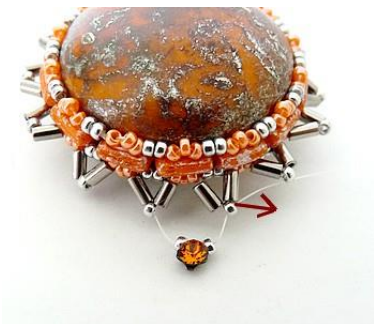
13) Pick up 1 R15, 1 SM (top hole) 1 R15 between the central R15