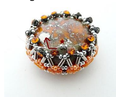
15) Pick up 2 R15 between the SM, repeat for the length of the pattern