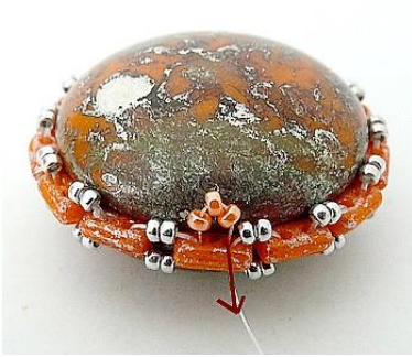
7) Pick up 3 R 15, exit through Piros