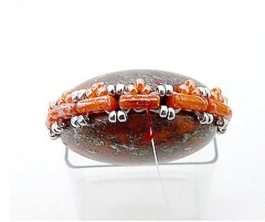
9) Repeat steps 7 and 8 for the length of the pattern and for the other side