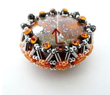
14) Tighten and exit through the top of SM