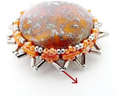
12) Repeat for the length of the pattern and exit through the central R15