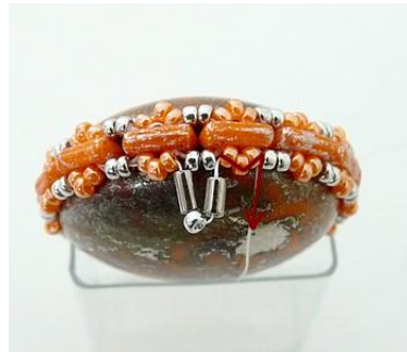
11) Pick up 1 B, 1R15, 1 B and exit through the 3 R15