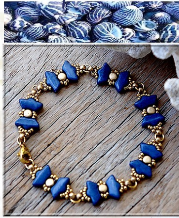
Delos® Opaque Curacao et Kalos® Light Gold Mat