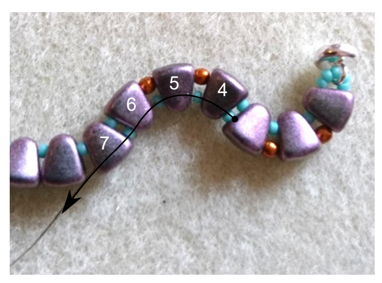
7. Pick up one 15/0. Sew through nib-bit 4. Pick up one 15/0. Sew through nib-bit 5. Pick up one 15/0. Sew through nib-bit 6. Pick up one 15/0. Sew through nib-bit 7.

Pick up one 2 mm round. Sew through nib-bit 3.