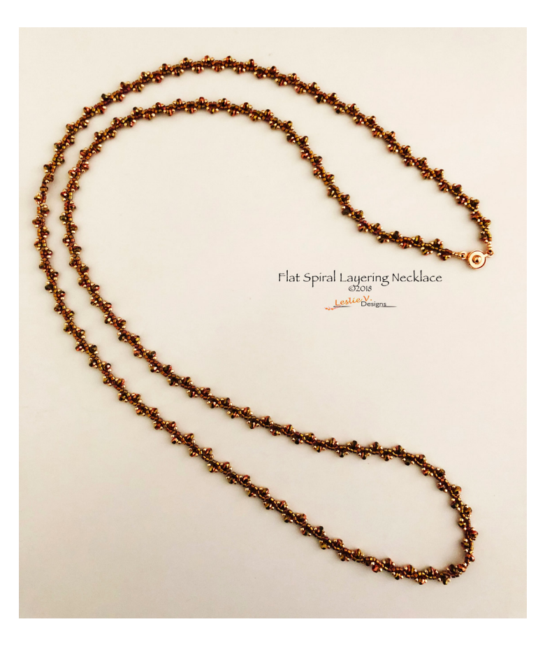
Flat Spiral Layering Nedklace Designed by Leslie Venturoso Copyright © 2018 Leslie Venturoso Designs www.leslieventuroso.etsy.com