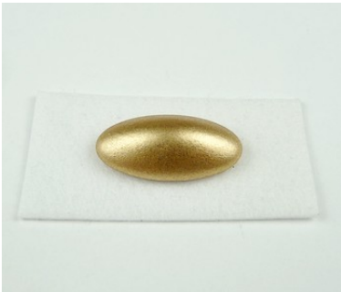
1) Glue the Athos on the backing . Let dry ☺