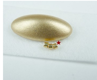
3) Pick up 3 DB11 and pass through the backing