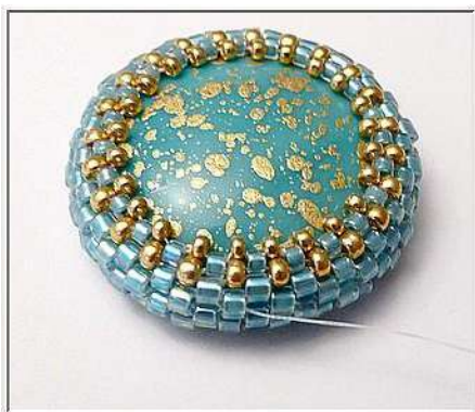
13) You should now have this.