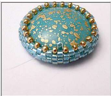
11) Add 1 row of DB11.