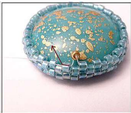
10) Add 1 row of SB11.