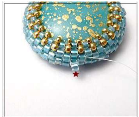
15) Add 1 DB10 and pass through the next DB10 of the row.