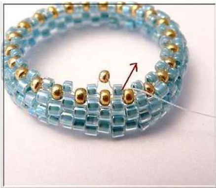
7) Add 2 rows of SB15.