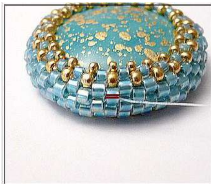
14) Exit through DB10 (2 nd row)