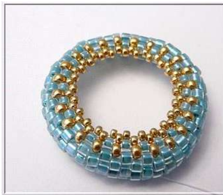
8) You should now have this. Go back through the rows of peyote until you reach the outer row of Delicas.