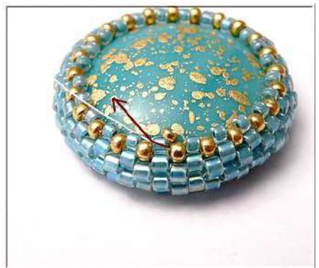
12) Add 1 row of SB15.