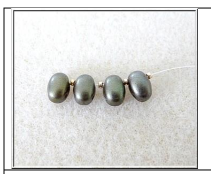
1) Pick up 1 R15, 1 Samos x 4