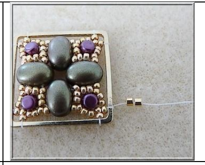
14) We're going to make some Brick Stitch all around the square, pick up 2 DB