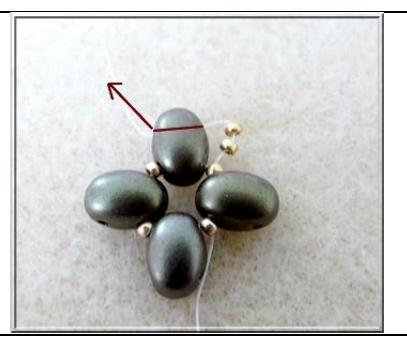
3) Pick up 2 R15 in the top hole of Samos