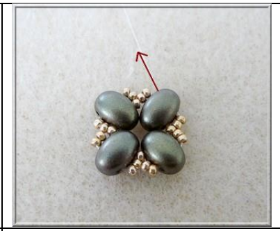
5) Repeat steps 3 and 4 between each Samos, exit through the Samos