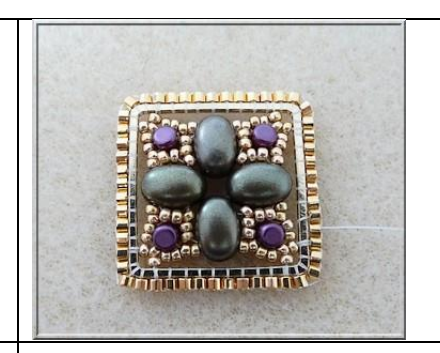
18) Repeat steps 16 and 17, to finish all the square