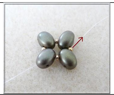
2) Close by a knot and exit through R15