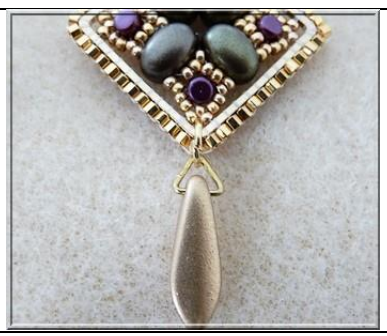
23) Pick up a ring at the opposite corner and pick up a teardrop (3)