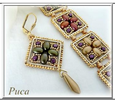
24) It's your turn, you can make earings, bangle or a pendant (3)