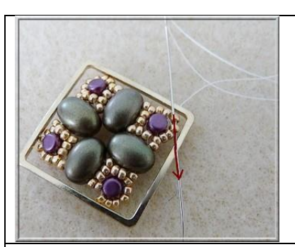
10) Pass through the last R15 and the central R 15