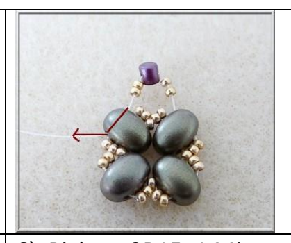
6) Pick up 2R15, 1 Minos, 2 R15, exit through the next Samos