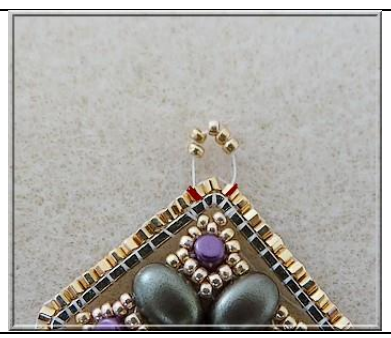
22) For the earrings, pick up 5 R15 in a corner, pass through all the beads twice. You can place your earing (3)