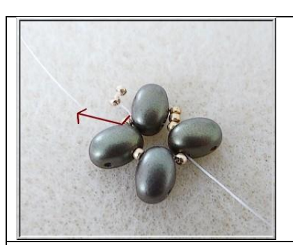
4) Pick up 2 R15, exit through the R15