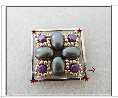
13) Repeat step 9 to 12 for the other corners