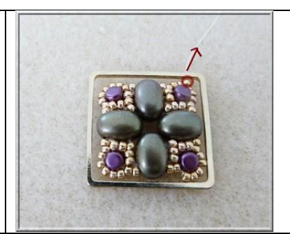
9) Pick up 1 R15 and pass under the square