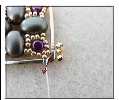
16) Pick up 1 Db, pass under the square