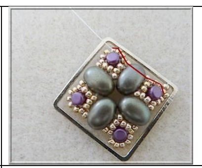
12) Exit through the next central R15