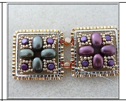
20) Pick up 1 Minos, exit in the DB, pass through the 4th DB. Make this twice to make your work strong. Pick up a 2nd Minos in