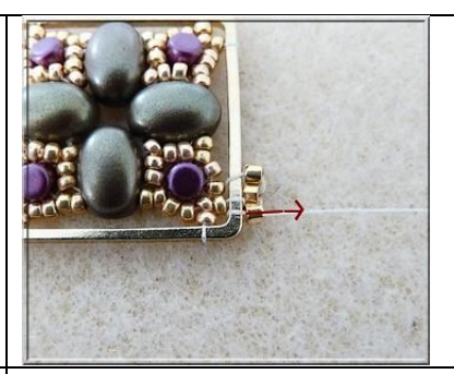
17) Exit through the DB