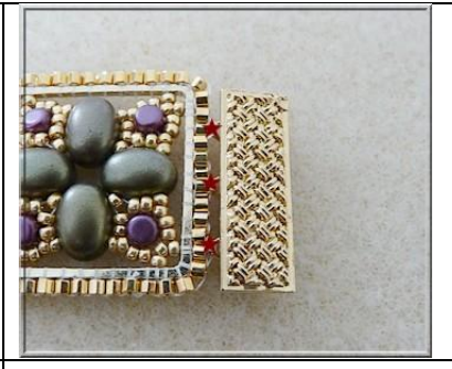
21) Make in total 7 elements (3) Pick up one clasp in the DB