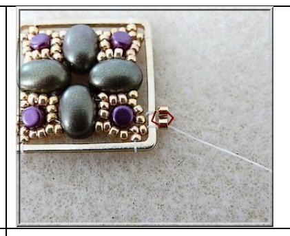
15) Pass under the square, exit through 1 DB and pass through the other DB