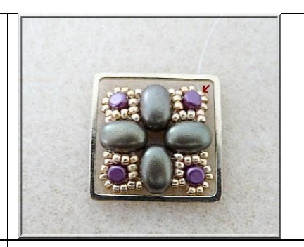
8) Place your square spacer