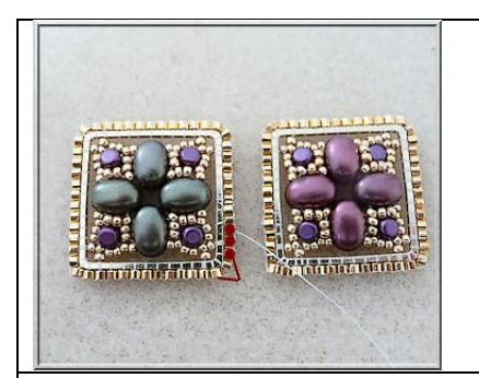
19) Make a second element (3), exit through the 3rd DB