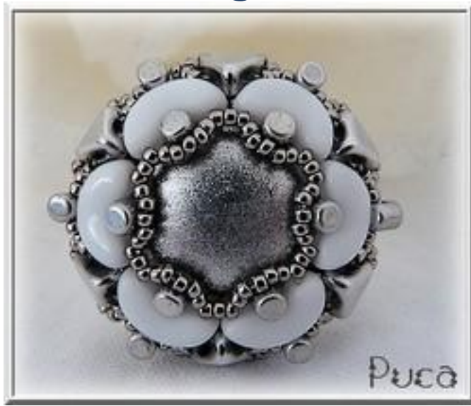
Schéma bague « Joana »®

Matériel : Arcos® par Puca® (A), Minos® par Puca® (M), Khéops® par Puca® (K), Rocailles 15 et 11 (R), Pinch Beads (P), 1 cabochon de 20mm ou Rivoli de 18mm pour la version petite. (5 Arcos). 1 support bague plateau 16mm.