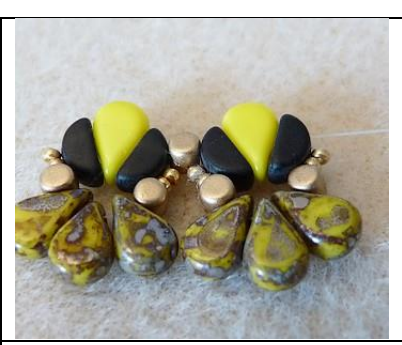
10) Repeat steps 1 to 7