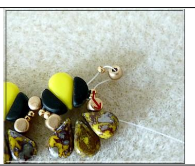
12) To finish your work, pick up 1 R15, 1 R8 . Exit through the Minos