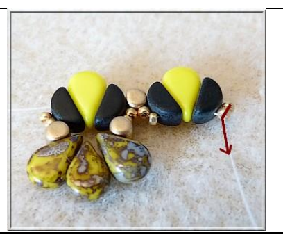
9) Pick up 2 R15 and exit in the opposite 2 R15