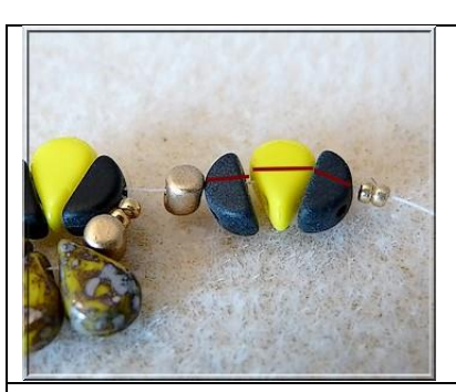
7) Pick up 1 Minos, 1 Kos, 1 Amos, 1 Kos and 2 R15