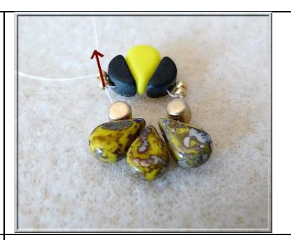
5) Pick up 1 Minos, 3 Amos and 1 Minos in the 2 R15 (face up)