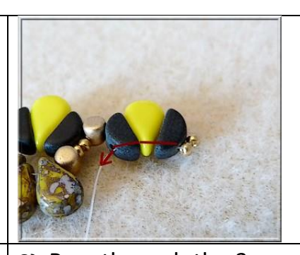
8) Pass through the 3 beads (a)