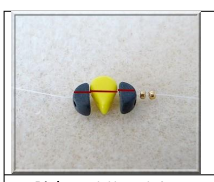
1) Pick up 1 Kos, 1 Amos, 1 Kos, 2 R15 (top hole)