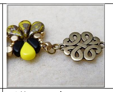
17) You can place one spacer, chain and clasp!

\label{eq:happy beading!} Thank you for respecting my work. \ensuremath{\mathbb{R}}