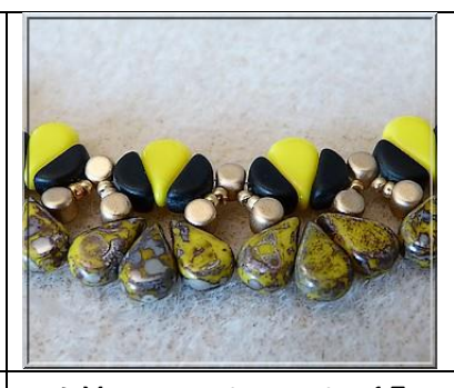
11) You must create 15 steps 🔞