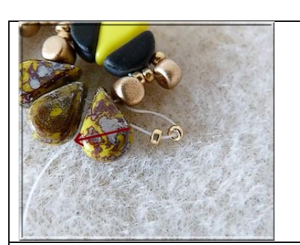
13) Pick up 2 R15 in the Amos