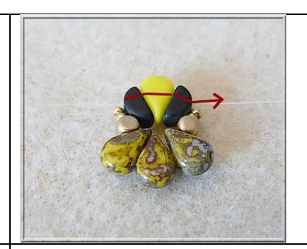
6) Exit through the Kos