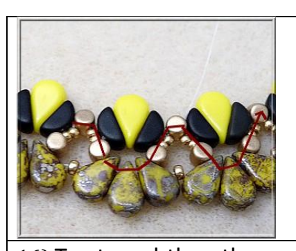
16) To strenghthen the Minos, pass through all the Minos of your work, like picture