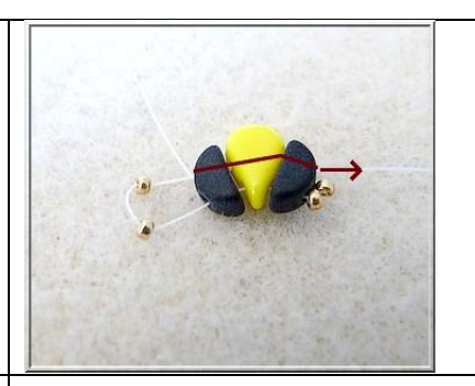
3) Pass through 2 R15 and exit through the Kos