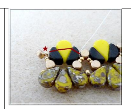
15) Pick up 1 R8 1 R15 at the end, pass through the Kos, Amos and Kos