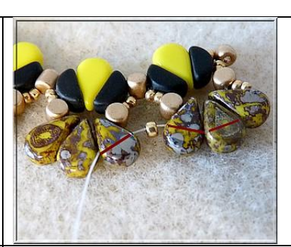
14) Pass through the Amos and pick up 1 R11 between the group of 3 Amos, repeat for all the row 3