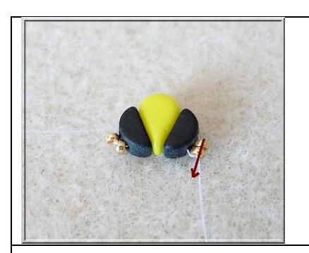
4) Exit through the 2 R15