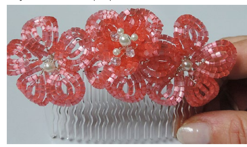
Step 20 Do not to leave ending wires. With hot glue gun, cover the back of the aircomb with satin or ribbon to avoid contact with the wires.