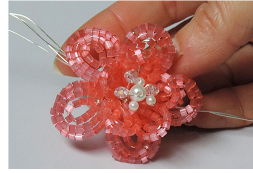
Step 18 Make 2 single flowers, using a pearl or a rocaille for the center. Using the wires secure flowers on the haircomb.