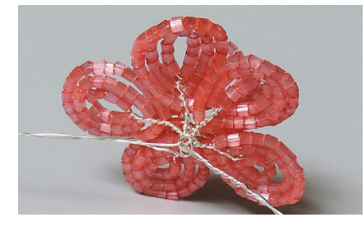
Step 15 Shape and adjust the petals.