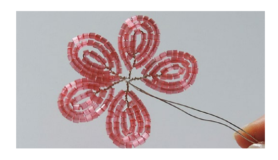
Step 10 Twist the two wires close to the join of the first and last petal to secure.