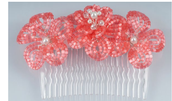
PRECIOSA Two-Cut Beads