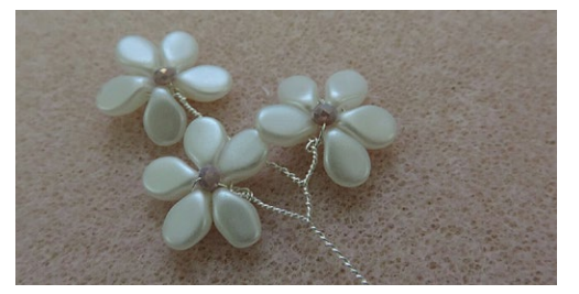
Step 14 Combine with simple filler accent simply twisting wires together.

Repeat the steps to obtain a third flower and twist wires leaving at least 5 or 6 cm tail.