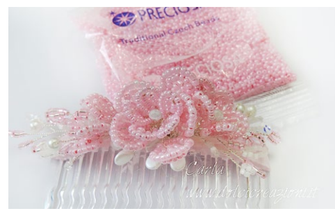
0,50 mm and 0,30 mm copper wire (silver plated) Haircomb and hair clip at your choice;

PRECIOSA Imitation Pearls 131 19 001; 3 mm; 02010/70502 131 19 001; 5 mm; 02010/70502