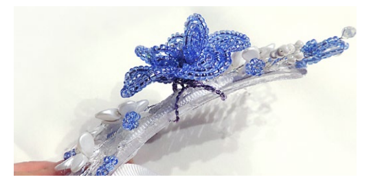
Step 18 This is the back of both hairpieces.

For the hair comb you can use two accents with Pip beads and a main double flower, using its ending wire to secure at the comb.