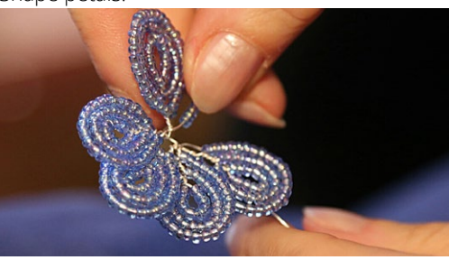
Step 14 Join wires and twist to secure.