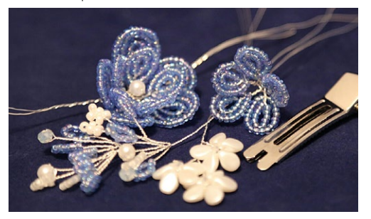
Step 16 Arrange flowers to match the clip length.

Step 15 For the Hair Clip make 1 double flower, 1 single flower, two single accents and 1 3 flowers Pip beads accent.