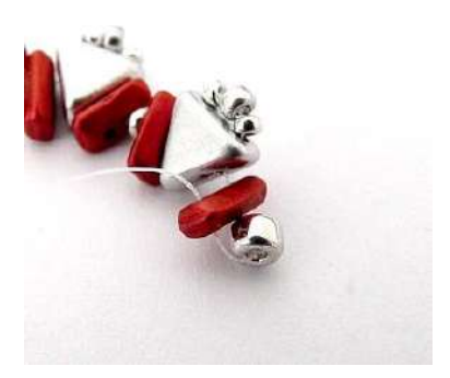
5) String 1 SB8 at the end of the necklace and pass through the 2<sup>nd</sup> hole of Piros.