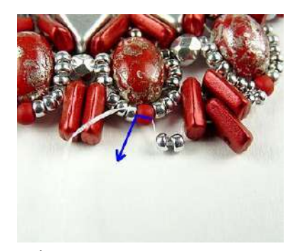
24) String 2 SB15 and pass through the next SB11.