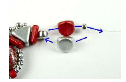
32) String 1 Ilos, 1 SB11, 1 Ilos and pass again through the SB8, Ilos and SB11.