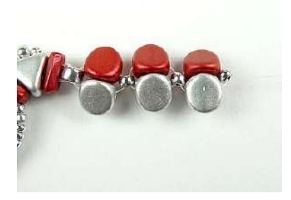
33) String 1 Ilos, 1 SB11, 1 Ilos and pass again through the SB11, Ilos and SB11. Repeat step until you added 24 Ilos (or the length you want it).