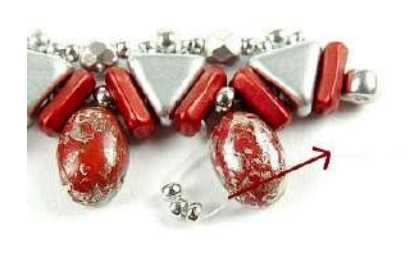
13) String 3 SB15 and pass through the 2<sup>nd</sup> hole of Samos.