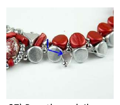
37) Pass through Ilos then add 1 SB11 between each Ilos (interior side of the necklace).