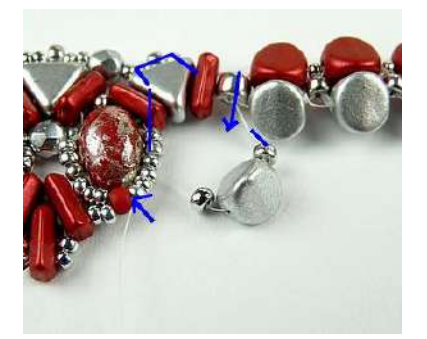
36) String 1 SB15, 1 Ilos, 1 SB15, pass through the SB11 (top to Samos), then pass through the beads and go out through the SB8.