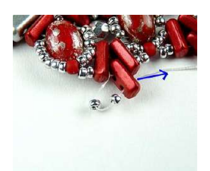
28) String 2 SB15 and pass through the next Piros