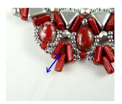
27) Pass through the beads and go out through the Piros (the first Piros from the group of 3).