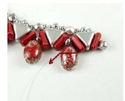
12) Pass through the beads and go out through the Samos.