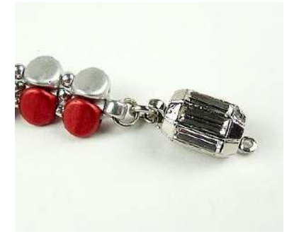
39) Add the clasp using a jump ring between SB8 and the clasp.

Happy beading! Thank you for respecting my work.