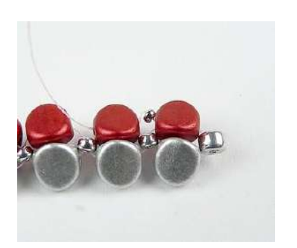
35) Pick up 1 SB15 between each llos (interior side of the necklace).