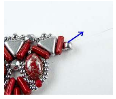
31) Pass through the beads and go out through the SB8.