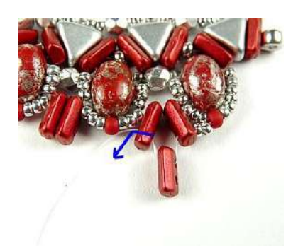
23) Pick up 1 Piros and pas through the next Piros.