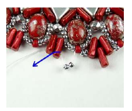
25) Repeat step 22 to step 25 until the end.