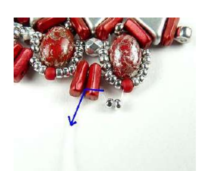
22) String 2 SB15 and pass through the Piros.