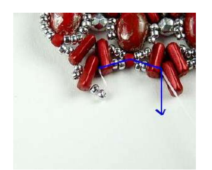
29) String 2 SB15, pas through the next Piros. Pass through the beads and go out to the next Piros. Repeat steps 28 and 29 until the end.