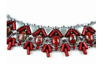
26) You will have this.