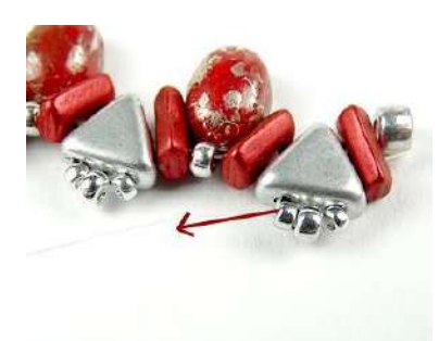
9) Pass through the beads and go out through the SB15.