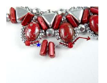
19) Pass through the beads and go out through the 3 SB15 after the SB11. String 2 Piros and pass through the 3 SB15 around next Samos. Repeat until the end.