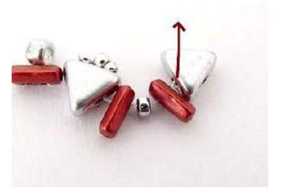
3) String 1 Piros, 1 SB11,1 Piros, 1 Kheops