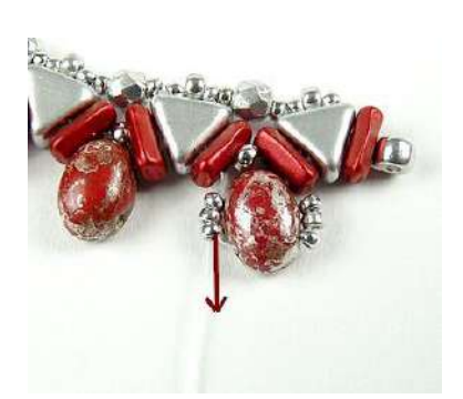
15) Pass through the first 3 SB15 added.