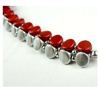
38) You will have this.