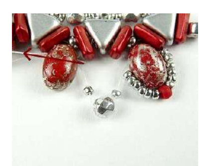
17) String 1 SB15, 1 F3, 1 SB15 and pass through next Samos.