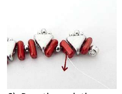
6) Pass through the Kheops and Piros.