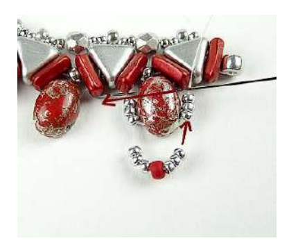
16) String 3 SB15, 1 SB11, 3 SB15, go around Samos and pass through the 3SB15 and the Samos.