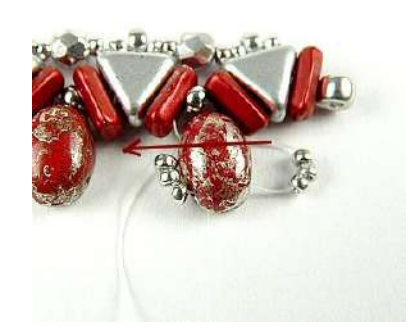
14) String 3 SB15 and pass through the other hole of Samos.