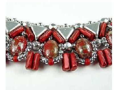
20) You will have this.