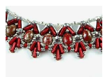
30) You will have this.