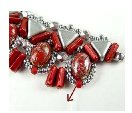
21) Pass through the beads and go out through the SB11.