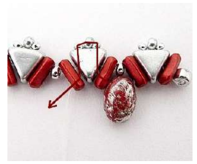
7) String 1 Samos and pass through next Piros. Pass through the beads and go out through the next Piros. Repeat step until the end.