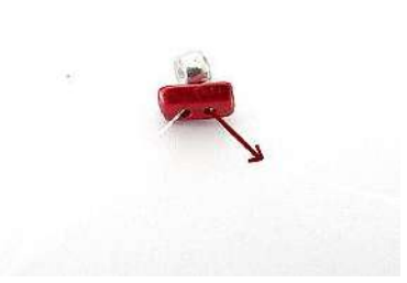
String 1 Piros, 1 SB8 and pas through the 2<sup>nd</sup> hole of Piros