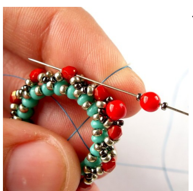
16) Repeat step 15 ...