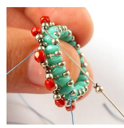
11) Add one 11/0 and one 15/0 and pass through the next 11/0 from the other side of the base ring (as shown in the photo)