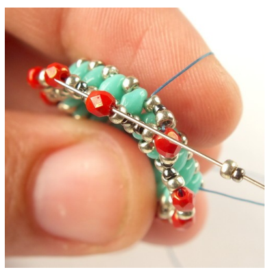
12) Add one 15/0 and one 11/0 and pass through the next 3mm FP.