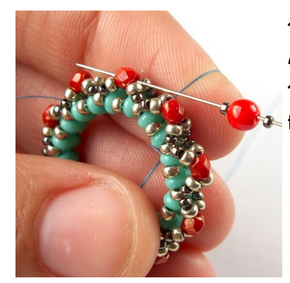
15) Add one 15/0, one 4mm round and one 15/0 and pass through the next 3mm FP.