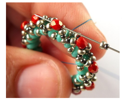
14) ... until you reach the end of the row.