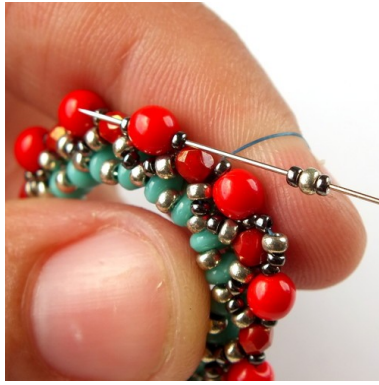
19) Add one 15/0, one 11/0 and one 15/0. Pass through the next 15/0, 4mm round and ≈15/0.