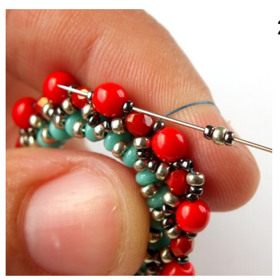
20) Repeat step 19 ...