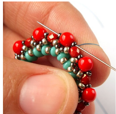
18) Make the step-up by passing through the first group of beads (15/0, 4mm round, 15/0) you added in this row.