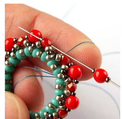
17) ... until you reach the end of the row.