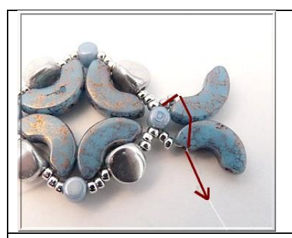
7) Thread through the second Arcos