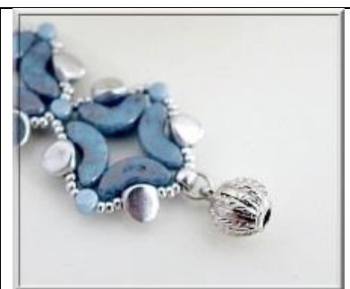
12) Attach the clasp into the R8 with a 4mm ring

Happy beading! Thank you for respecting my work ©