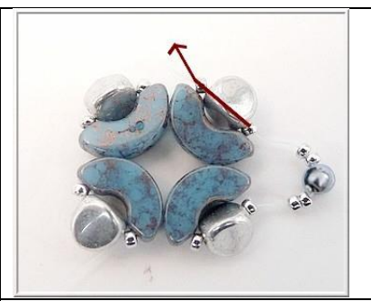
4) Pick up 2 R15, 1 R8, 2 R15 and then 2 R15, 1 Minos and 2 R15 x3