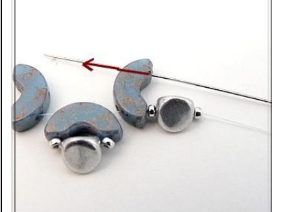
2) Repeat 4 times