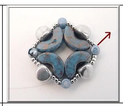
5) You will now have this Thread through the Minos