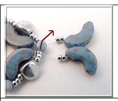
6) Pick up 2 R15, 2 Arcos, 2 R15, thread through the first Minos