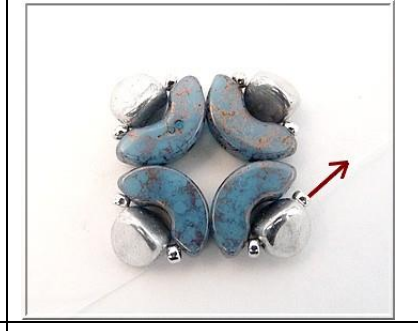
3) You will now have this Thread through the R15