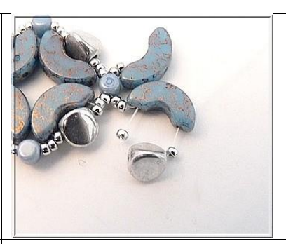
8) Pick up 1 R15, 1 Ilos, 1 R15, thread through the Arcos like step 2