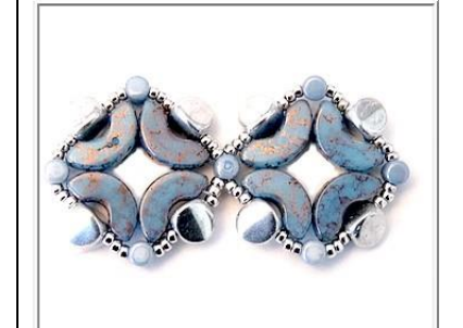
10) You will now have this 🔞