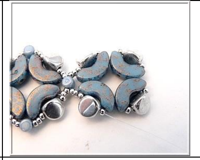
9) Repeat steps 3 to 5, finish with a R8 for the last element (3)