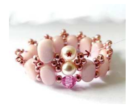
9) Insert 1 SB11, 1 RB4 and 1 SB11, then finish the round with Lipsi 😇