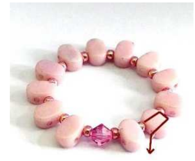
2) Close and exit through the second hole of Lipsi HERE