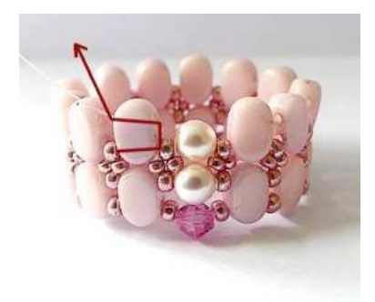
10) Here is the result \bigcirc Exit through the second hole of Lipsi