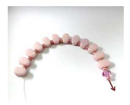
1) Alternate 12 Lipsi and 12 SB11 on the thread (according to the size of the finger), then 1 SB11, 1 B4 and 1 SB11