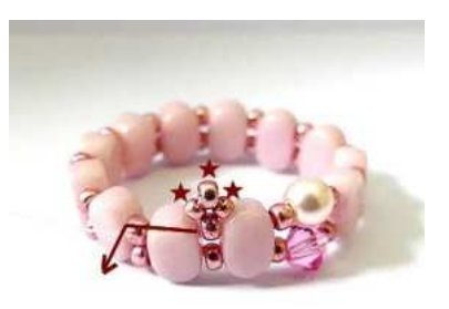
6) Insert for each SB11, 1 SB15, 1 SB11 e 1 SB15. All the way around