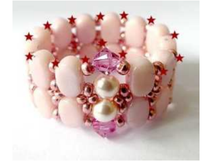
11) Insert 1 SB11 betweenthe Lipsi all the round.Insert 1 SB11, 1 B4 and 1SB11 at the level ofdesign. End your thread