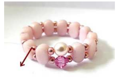
5) Here is the result 😇 Exit through the SB11 HERE