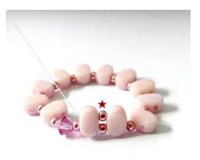
3) Insert 1 SB11 between Lipsi