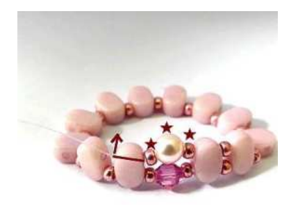
4) Insert 1 SB11, 1 RB4 and 1 SB11 through the next Lipsi. Insert 1 SB11 all the round