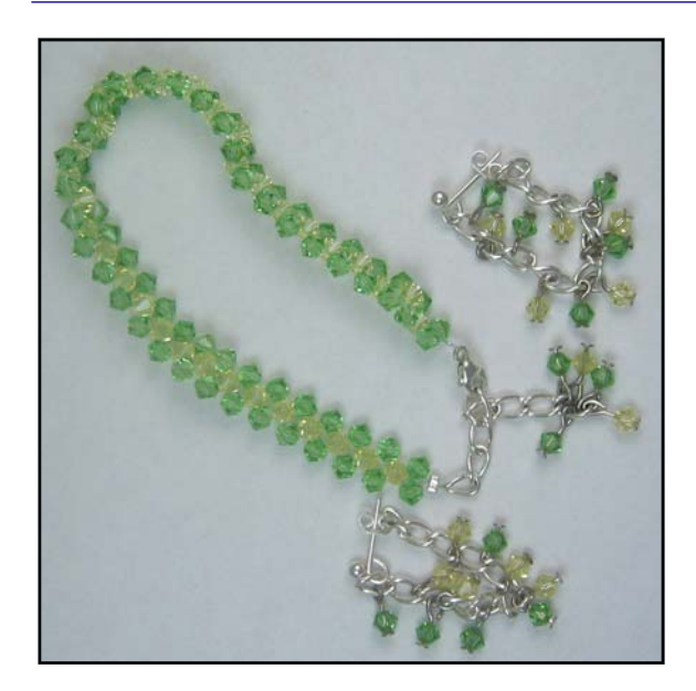
1 Peridot and Jonquil