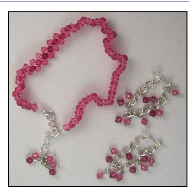
2 Fuchsia and Rose